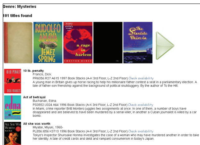
Figure 2. Recreational reading website, mystery genre page, http://library2.csUMB.edu/voyager/readinglist.php?genre=mystery&fiction&index=655H

book descriptions inserted from local storage into the entry for each title (see figure 2).