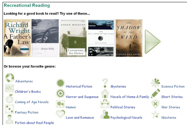
Figure 1. Recreational reading website, main page, http://library2.csumb.edu/read

Book cover images are available from a variety of third parties, including commercial services, but the lack of funding for