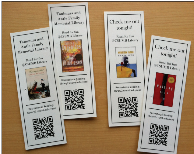
Figure 4. Promotional bookmarks

the collection circulated. Fortunately, the Voyager APIs also enable one to retrieve usage statistics for the titles in each genre. Just before going live with the site at the start of the 2011–12 academic year, benchmark circulation data were generated for the two preceding years, giving us an average annual rate of circulation for each genre. Twelve months later another set of circulation data was generated for comparison. As table 1 illustrates, most genre collections experienced an increase in use during the first year the virtual collection was available, particularly Mysteries, Short Stories, Love and Romance, and Humor. We saw a 21.6 percent increase in circulation, a strong indication that organizing, presenting, and promoting these materials succeeded in bringing them to the attention of our user community.