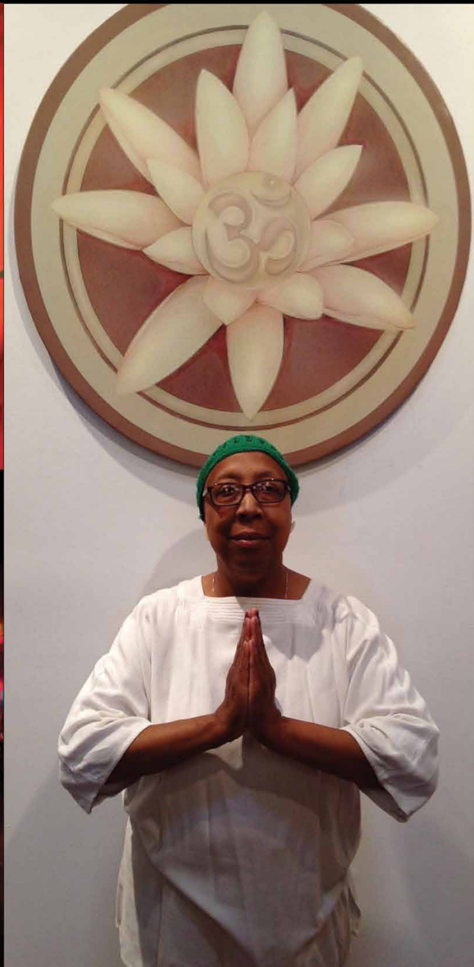
Every 21 days: Cancer, Yoga, and Me