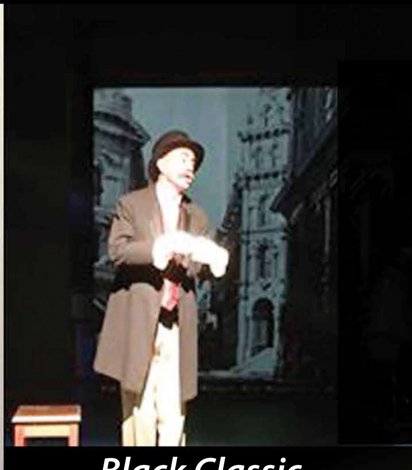
Black Classic Southside Theater, SF