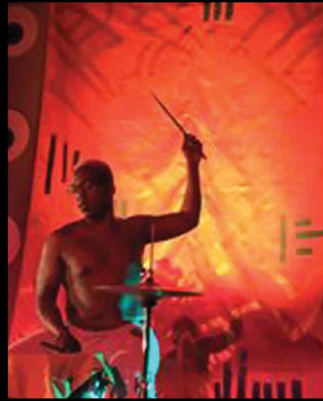
Blank Map Dance Mission Theater, SF

Performance / Lighting Design / Projection Design