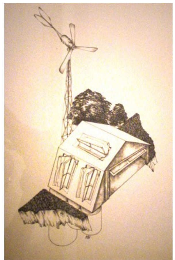
Figure 2 My first energy invention - a pre-fabricated garage with solar parabolic troughs, windmill, bio-digester, and hightemperature thermal energy storage (1974)