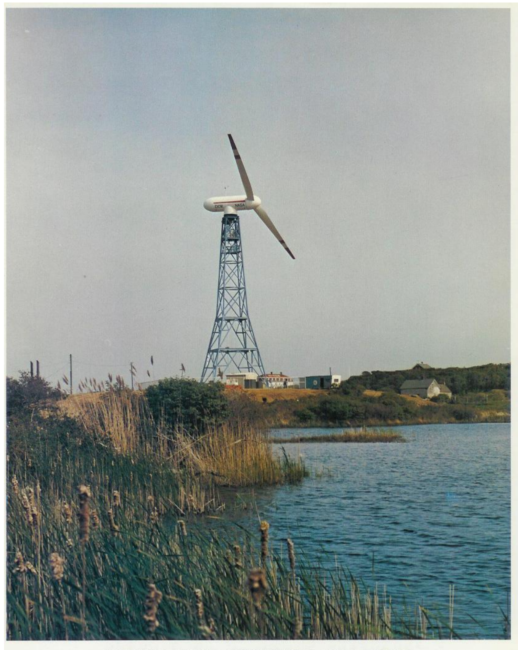
DOE/NASA 200kW EXPERIMENTAL WIND TURBINE Block Island, Rhode Island

Figure 1 One of only six grid-connected windmills in the United States in 1979. I was sent to look at 4 of the six by JPL.