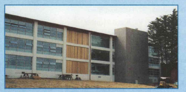
Building 47, home of the new Campus Service Center

After several transition phases, the new Campus Service Center is open for business in totally refurbished Building 47. There's no longer a need for students and employees to visit offices spread around the campus to take care of such things as paying fees, getting Otter Cards, obtaining keys, picking up transcripts and buying parking permits. Nicknamed 'The Stop," it's a true one-stop shop for students, providing everything for administrative, nonacademic activities.