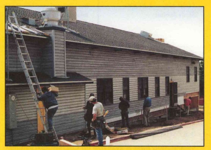
The BBC will be ready to open in early November.

There is a warm spot in the hearts of all alumni for the Black Box Cabaret (BBC). It's long served the campus community as a coffee house and place of entertainment. In early November, the rebuilt and totally refurbished BBC is slated to open adjacent to the current Human Resources office (Building 80), near the back of Building 82. The staff of the BBC is now scheduling events to be held on Tuesdays, Thursdays, Fridays and Saturdays. The BBC has its own website: CSUMB.EDU/bbc.