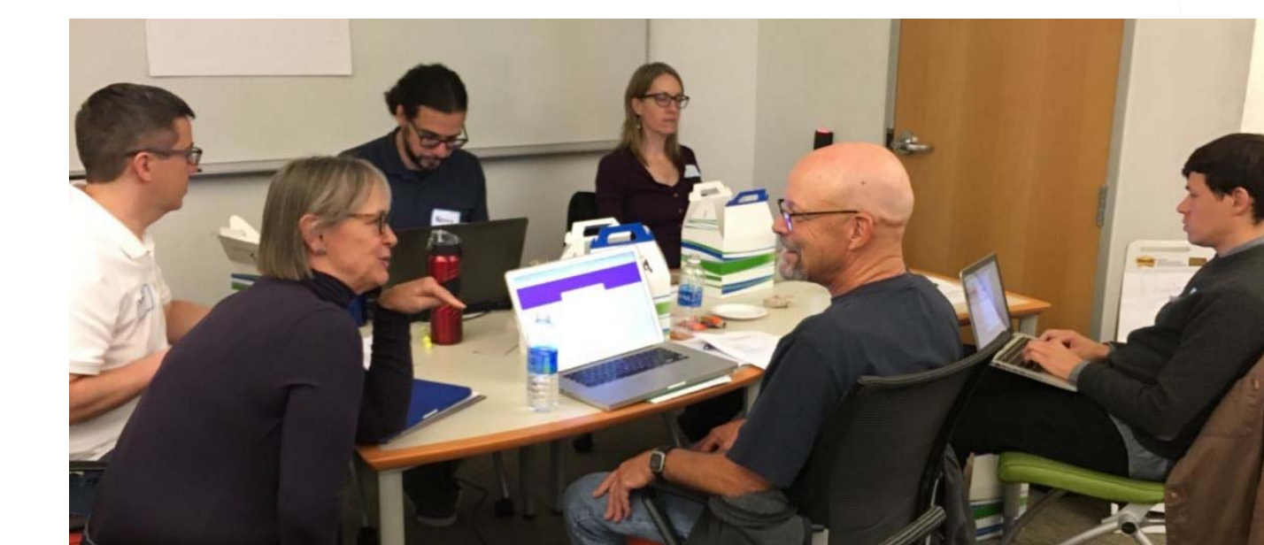
Figure 2: Faculty engaged in assessment work

With time for reflection built into the assessment process, faculty are engaged with the intellectual skills, including information literacy, and discover ways to improve teaching and learning.