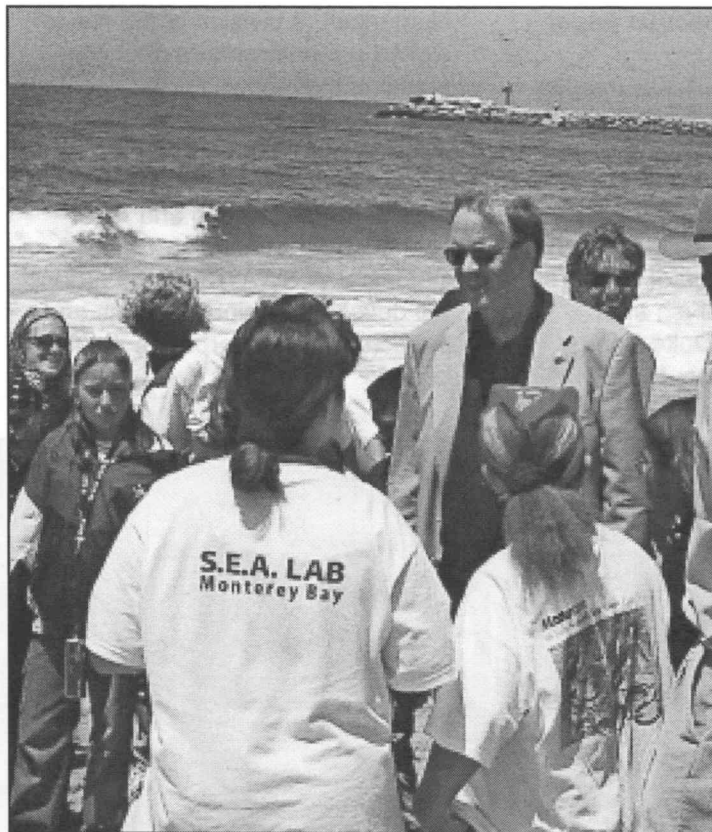
Congressman Sam Farr greets the students on the last day of the Inaugural session of S.E.A. Lab .Monterey Bay.

A one week pilot program, held July 24-28, took the students on a journey of guided explorations through the unique habitats of the Monterey Bay National Marine Sanctuary - from the watersheds and rivers through coastal environments out to the deep sea. Each day they had an opportunity to interact with and work along side coastal naturalists, marine biologists, and