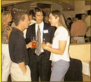
Young professionals enjoy Networking Night.

University Center Living Room Networking Night is sponsored by Monterey County Young Professionals Group and the Alumni Association.