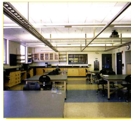
Panoramic view of one of the new science center's spacious labs

The classrooms are designed to create learning environments capable of serving multiple teaching formats — from individual