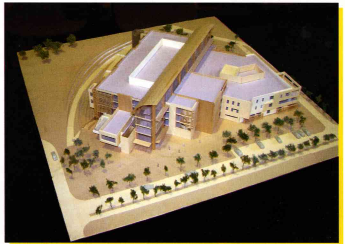
The architect's model of CSUMB's future library building

The library will be the single largest building constructed at CSUMB. It's intended to eventually serve 8,000 students on campus and several thousand off-campus distance learners, as well as residents of the region. ❖