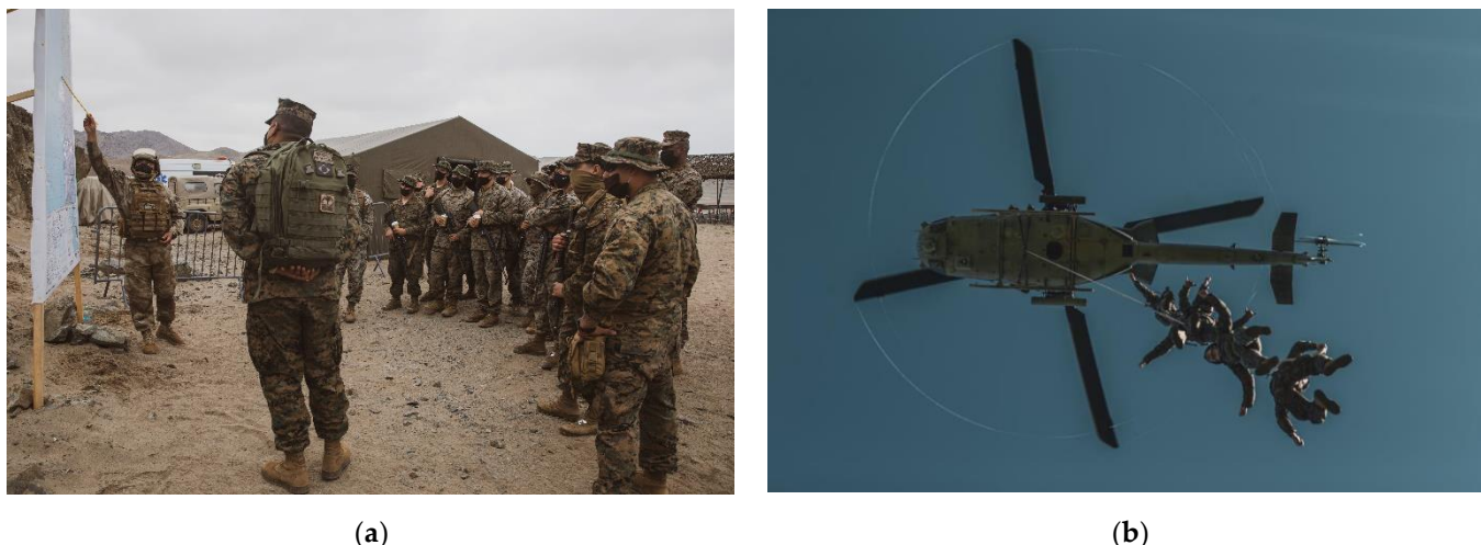
Figure 1. (a) Extensive mental and physical preparation provides the core foundation of every US Marine; (b) Tactical operations are a central function of a US Marine.

Recently, the term tactical athlete has been used to refer to service professionals of any age, gender, and race who are firefighters, law enforcement, emergency responders, and military who are physically and mentally capable of withstanding all of the physical hardship associated with their respective duties (Figure 1) [15]. The United States Marine Corps (USMC) defines a tactical athlete as any Marine who trains for combat readiness using a comprehensive athletic approach [16]. The tactical athlete incorporates strength, power, speed, and agility to help ensure their fitness level meets the requirements for combat readiness [16]. With that said, it may be reasonable to consider Active Duty Marines 40–50 years of age as tactical MA.