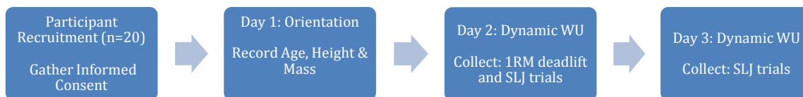
Figure 2. Study time line overview of events (WU-warm-up; 1RM-one repetition maximum; SLJ-standing long jump).

During the second data collection day a dynamic WU was conducted comprised of low intensity drills that the participants were acquainted with (10 jumping jacks, 10 cross jacks, 10 squat hops, 10 quick hops, 10 quick jumps, 10 lunges (5 each leg), 10 push-ups, 10 sit ups, 10 Chris Farleys, 10 arm circles forward, 10 arm circles backward, and 10 jump tucks). This was the same dynamic WU conducted prior to the DL PAP conditioning activity (described above). Following the dynamic WU (5-6 minutes) two SLJ trials were collected in the identical manner as described above. The goal of the dynamic WU was to increase blood flow and body temperature as well as provide sport specific drills to prepare the athletes for the upcoming SLJ trials (Baechle & Earle, 2008).