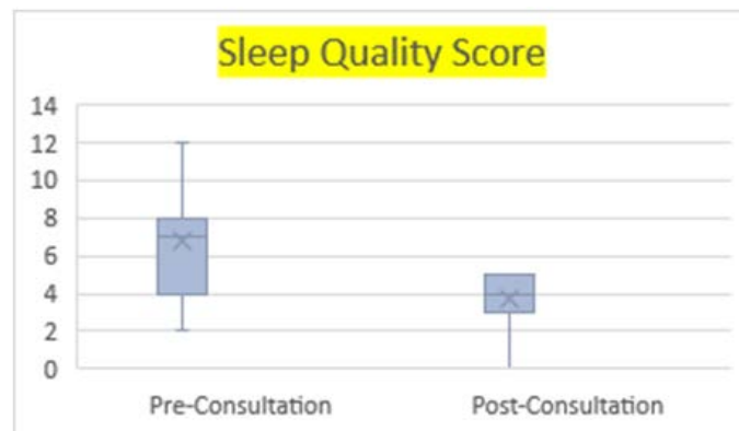
Figure 2. Paired Samples T-test for the Difference Between Pre- vs. Post Survey Answers for Sleep Quality. Whiskers indicate the minimum and maximum perceived stress scores. The mid-line represents the median, and the dots represent the outlying points. The beginning of each box indicates the lower quartile scores, whereas the end of each box represents the upper quartile points