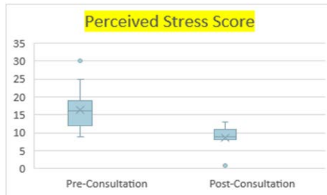
Figure 1. Paired Samples T-test for the Difference Between Pre- vs. Post Survey Answers for Perceived Stress. Whiskers indicate the minimum and maximum perceived stress scores. The mid-line represents the median, and the dots represent the outlying points. The beginning of each box indicates the lower quartile scores, whereas the end of each box represents the upper quartile points.

9.5% Asian/Pacific Islander, and 4.8% identified as "other". In relation to school standing, 57.1% of participants were junior status, 28.6% were sophomores, 9.5% were seniors, and 4.8% were 1st year students. The decrease of PS ( t=2.659 , df=14 , p=.019 , M=11.53 , SD=6.424 ), and the increase of SQ ( t=.3166 , df=14 , p=.007 , M=5.07 , SD=2.963 ) were both found to be statistically significant. See Figure 1 and Figure 2 . There were no statistically significant differences between the pre- and post- scores of and PA, although an increase was observed ( t= -.317 , df=14 , p=.756 ). See Figure 3 .