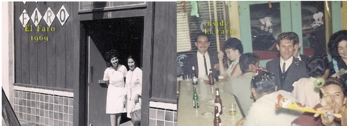
Left: Two women emerging from the entrance to the bar and restaurant. Right: What appears to be a joyful celebration occurring inside El Faro.

Images of El Faro from the latter half of the 20th century found in “Chinatown: Oral Histories - Salinas, CA (PART 1).” This bar and restaurant was opened by Cathy C. Miller’s grandmother, and it indulged in significant cultural expression.