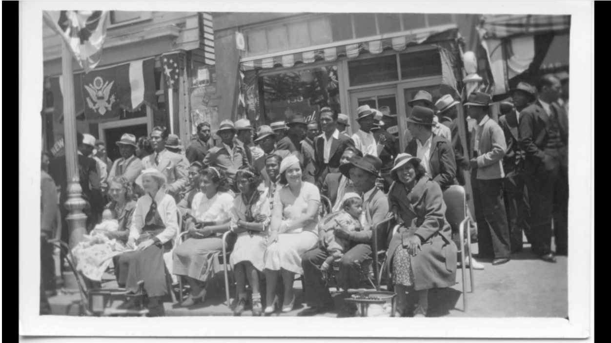
This photo captures a crowd gathered for an unknown spectacle on one of the streets that make up Chinatown. Most importantly, the image captures the ethnic community happily and peacefully congregating.