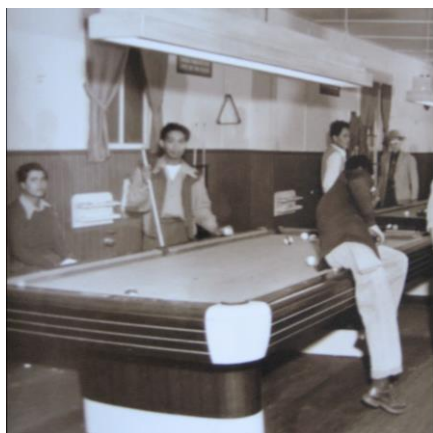
The pool halls and pool players of Chinatown. These photographs were compiled from the oral history video, "Filipino Experience in Salinas Chinatown."