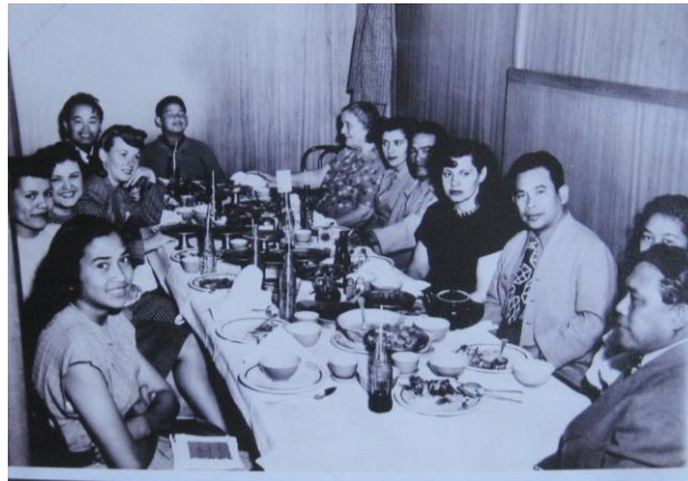
Above: Well-dressed clients enjoying a meal at the Republic Cafe.