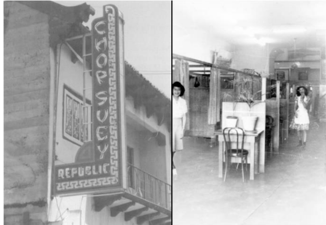
Left: A neon light sign reading, “Chop Suey” from the iconic Republic Cafe. Right: Waitresses inside the cafe.

These photographs are of the popular Republic Cafe, the Chinese restaurant famous for its chop suey and favored by many. These images were gathered from the oral history video, “Filipino Experience in Salinas Chinatown.”