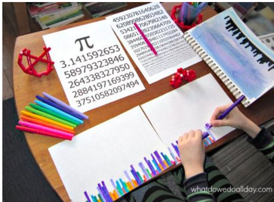
Figure 1. Pi Skyline . 4 Mar. 2014, www.whatdowedoallday.com/wp-content/uploads/2014/03/math-art-pi-city-1.jpg

In the first few weeks at my new school, I was diagnosed with several minor learning disabilities. For the first time, with the help of my teachers and my parents, an Individualized Education Plan (IEP) was created for me to enhance and embrace my learning style. Additionally, in math, science, language arts, social studies, and even Spanish classes, everyone learned through arts education. For me, the difference was phenomenal. I understood the material we were learning, I was engaged, and I genuinely loved learning. In language arts we learned proper sentence structure through the creation of catchy songs we made up as a class, and in science we memorized the human bones with a dance attributing each bone to a different movement. When learning about Pi ( \pi ) in math, we created a “Pi Skyline” with graph paper, graphing each number of Pi using different colors for as long as we wanted to go. Figure 1 provides a visual for the concept of the “Pi Skyline.”