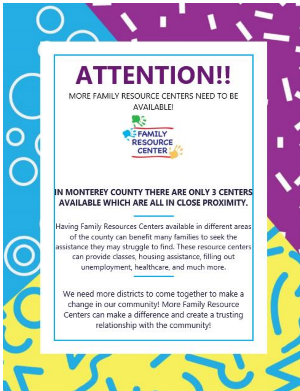
Figure 1. Handouts that were used to give out and educate the community to inform them about the benefits of them.