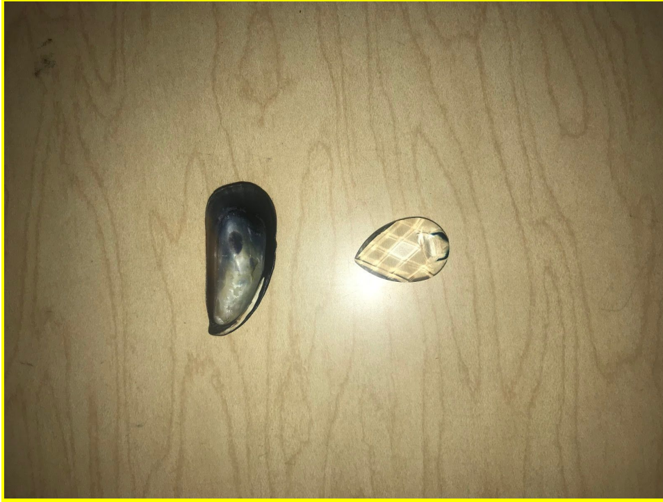
Image 2. The “shell and crystal” method used by Jasmine in her classroom to help with conflicts.