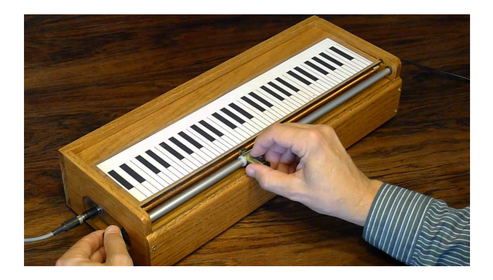
A Tannerian (electro-theremin) ~ 2011