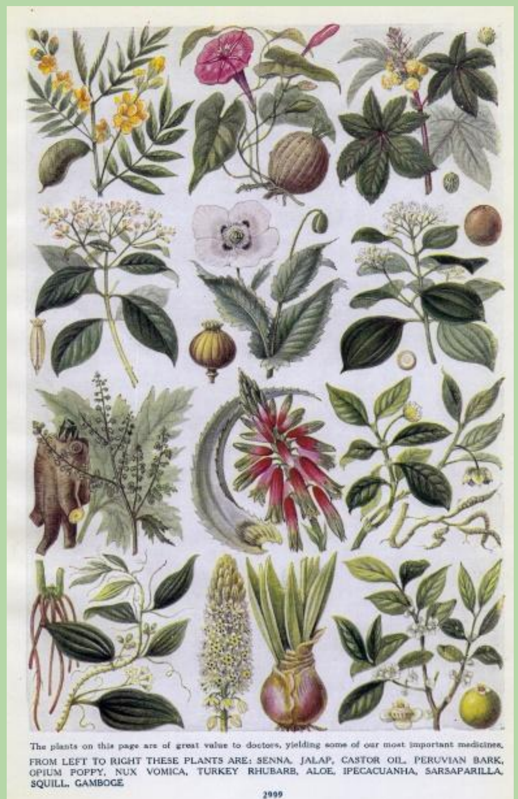
The plants on this page are of great value to doctors, yielding some of our most important medicines. FROM LEFT TO RIGHT THESE PLANTS ARE: SENNA, JALAP, CASTOR OIL, PERUVIAN BARK, OPIUM POPPY, NUX VOMICA, TURKEY RHUBARB, ALOE, IPECACUANHA, SARSAPARILLA, SQUILL, GAMBOZE

Whatever its virtues may be, it is still regularly cultivated for medicinal purposes. At present it would pay to extend its cultivation, seeing that we use from 10 to 20 tons of it, the pre-War supply being largely from Germany. Its price has gone up from 20s. a cwt. to over 40s. a cwt.