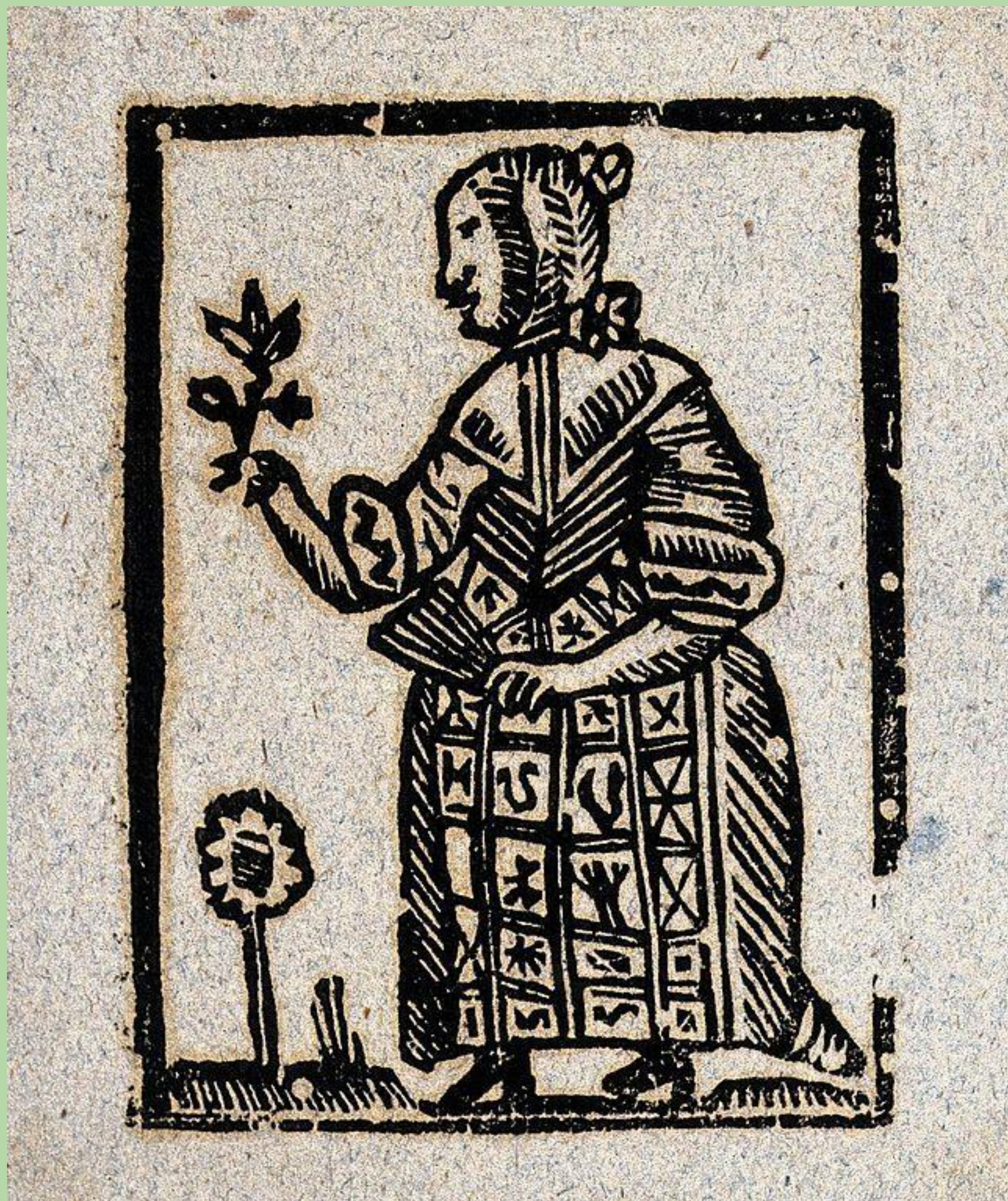
Image by:File:A witch holding a plant in one hand and a fan Wellcome

Traditional herbal medicines used for centuries are now highly uncommon compared to the man made pharmaceuticals doctors have prescribed us with. Yes, they help and do what they are meant to but how come we go to these first? Why instead of peppermint or ginger tea do we take pepto bismol? Without a thought we immediately turn to the chemically man made medicines marketed to us rather than trying something natural that has the same purpose first. We pollute the Earth that has done nothing but given us the tools to help ourselves and our discomforts while relying on our chemical creations instead of what Earth has given us naturally for free. I hope to inform and inspire people to think more about what they are using and to try something natural before moving onto pharmaceuticals.