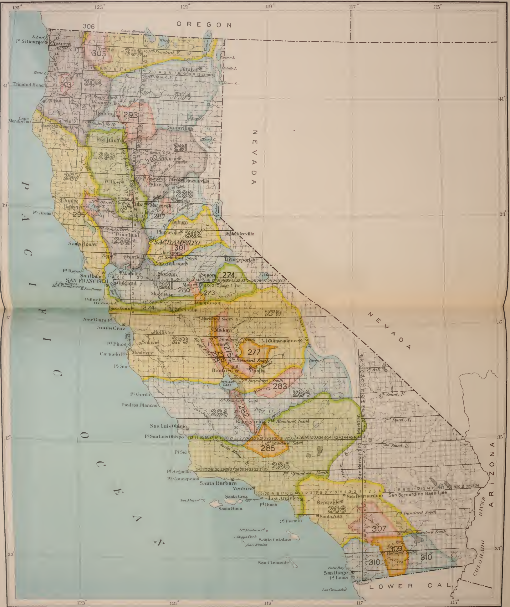
CALIFORNIA I SCALE 62 MILES TO 1 INCH